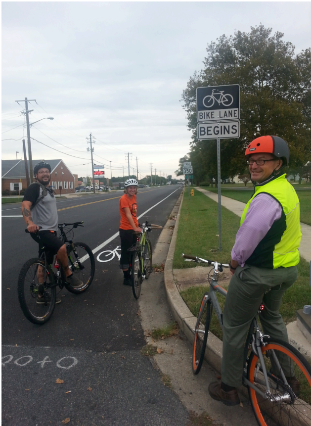
Members of Bike-SBY (Salisbury), ESIMBA (Eastern Shore International Mountain Bicycling Association), and Bike Maryland tour a new 'road diet' on Maryland Route 350, which added bike lanes to Salisbury's growing bike network.