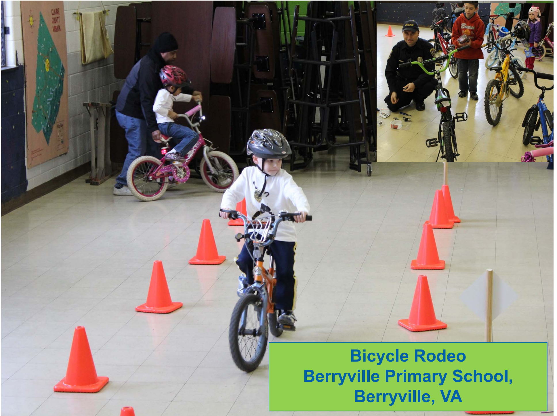
Bicycle Rodeo Berryville Primary School, Berryville, VA