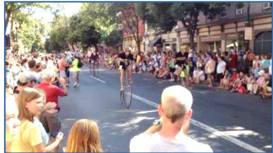
Clustered Spires High Wheel Race