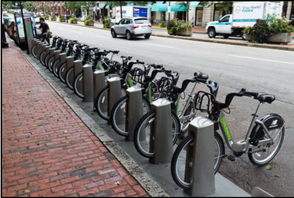
Hubway - Boston